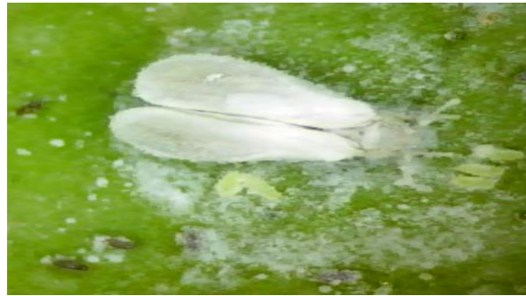
Figure 1. Adult ash whiteflies, S. phillyreae (Haliday).

The ovipositing females form a fine waxy powder in the form of circular spots on the host plant. Development time and hatching took 8-9 days and the adults had yellowish body with pure white wings. The body length was 0.59-1.41 mm including the wings. Females were usually larger than the males (Figure 1).