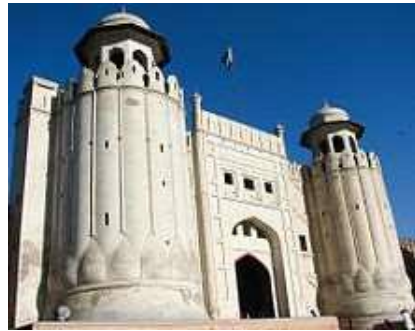
Figure 4. Alamgiri Gate

Lahore city had gained the ultimate height of its splendor during the Mughal period (Kabir, Abbas, & Hayat, 2017).