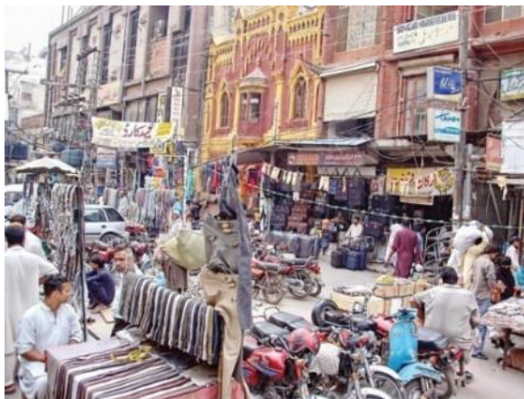
Figure 12. Market in Walled City

The shopping malls and Carrefour have replaced the muhalla markets or local bazaars. The locals lack the sense of ownership and do not bother about the surveillance of the area. The activities in the commercial and office areas start at a particular time in morning and end at night. These areas remain abandoned for quite a long time and they encourage the criminals to find their ways there. Hence, the crime rate is peaking in these commercial areas.