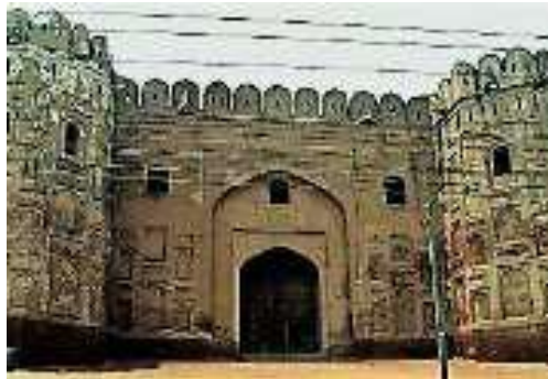
Figure 1. Masjidi Gate Lahore Fort

His heir Jahangir built a hunting resort, Hiran Minar in the suburbs of Lahore. His successor was Shah Jahan who built the Shalimar gardens in 1642.