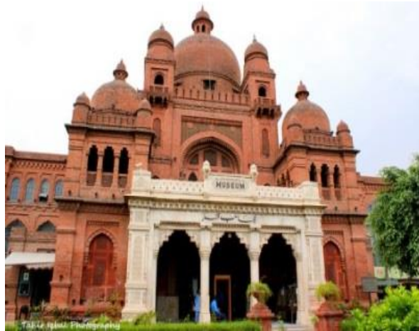
Figure 11. Lahore Museum (1890)

Industrial revolution brought a new approach towards use of new materials and techniques of construction which was also reflected in the architecture of Lahore by the late 19 th century. Concrete, glass and steel were the new materials introduced in the construction industry.