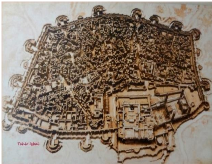
Town Figure 15. Layout of Walled City