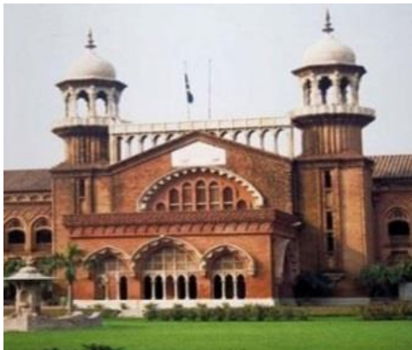
Figure 10. High Court (1879)