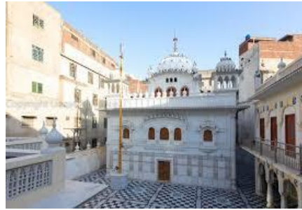
Figure 6. Guru Ram ka Gurdawara

The Sikhs caused a lot of damage to the already existing Mughal structures. Marble and semi-precious stones were taken off from the existing Mughal buildings and were incorporated in the new Sikh structures.