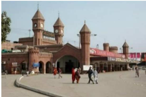
Figure 7. Railway Station (1861)

the British imperialism which was completely western style and influenced by Greeks and Romans, e.g. Montgomery Hall, Lawrence Hall and Railway Station.