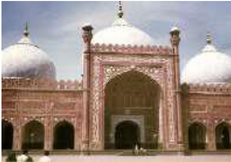
Figure 3. Badshahi Mosque

Gateway was built on the western zone of the fort by the last Mughal emperor Aurangzeb.