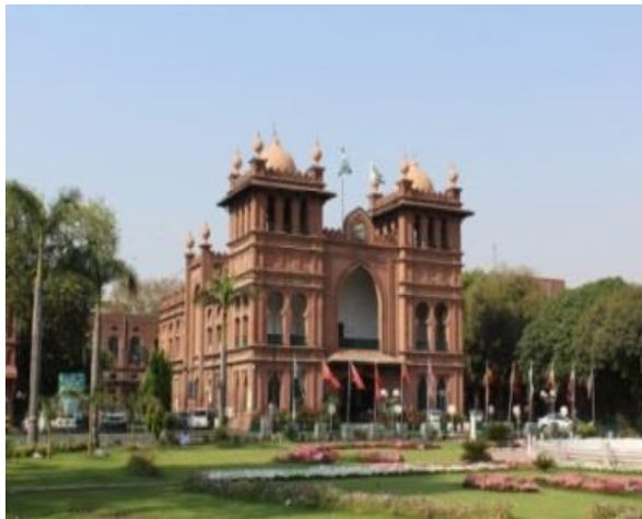
Figure 9. Town Hall (1890)

The other style was Indo European, which was a fusion of the traditional elements used by Mughals like domes, minarets, columns, cupolas, brackets, Moorish and multi foiled arches, piers, pilasters, crenellated parapet, pavilions, chatris with western elements like pediments, dentils, cornices eaves, turrets, spires, Venetian and Florentine windows, truss roofs, stained glass, tracery etc. used to develop a harmony with the architecture of the area. Lahore Museum, High Court and Town Hall are the particular examples of this particular architectural style (Kabir, Abbas, & Hayat, 2017).