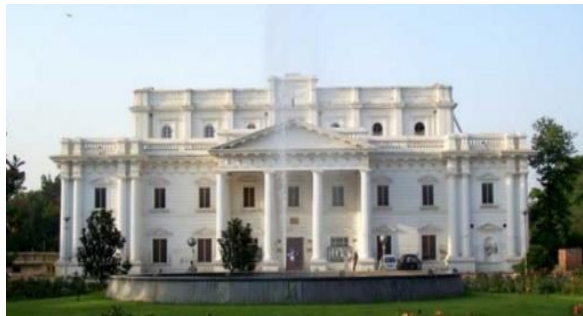
Figure 8. Lawrence Halls (1864)