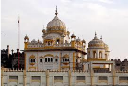
Figure 5. Smadhi of Ranjit Singh

The construction of religious buildings in the city began under the influence of the Sikh rulers which included the Gurdwaras, Hindu temples, and mosques. The Samadhi (mausoleum) of Ranjit Singh is the most noteworthy monument of Sikh period. The architectural style of Samadhi is an amalgamation of Hindu and Muslim style. Another monument of the Sikhs that can be seen today at Chuna Mandi Lahore, is Guru Ram ka Gurdawara.