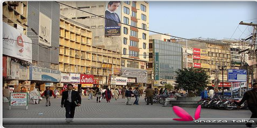
Figure 13. Market in Liberty

As the social system is changing, so are the building materials and techniques. The high-rise plazas and office buildings and residences have the linear decor elements, simple fronts and very fine finishing and materials such as concrete, wood and glass are used. Facades with huge windows and glass curtain-walls are also very well appreciated by the clients (Dawn advertisement, 2012).