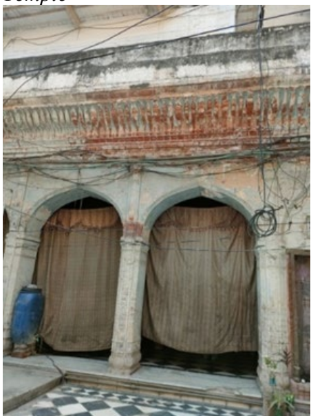
Figure 9 Building Infrastructure of the Temple