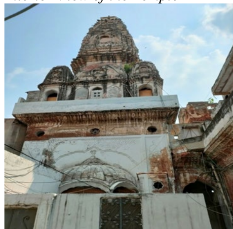
Figure 4 Interior View of the Temple