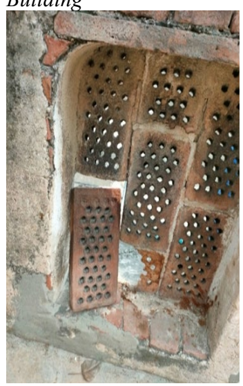
Figure 8 Staircase