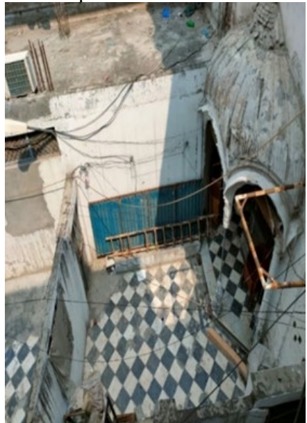
Figure 11 Household in the Courtyard of the Temple