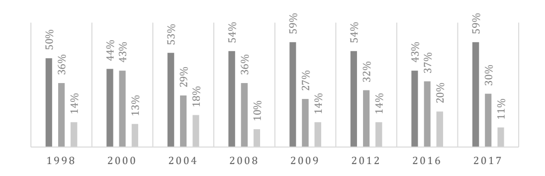
Figure 1. Gallup report released in august 2019

For the analysis of depressed employees, 5 well-reputed public and private sector organizations were selected for the survey to evaluate stress and depression in employees. These organizations are located in surrounding the region of Rawalpindi and Islamabad. The results as shown in figure F-2 was alarming because more than 60% of evaluated employees of the public sector are suffering from cautioned behavior while 4% of the strength has undergone extreme stress and depression. More than 65% of the private sector is also not able to cope with their stress while 19% are found a significant amount of depression. They are requiring to be centrally focused on the rehabilitation procedure. About one-fourth of the employees are suffering from the intermediate level of stress. They also need to be assisted in controlling stress. It is also a fact that a moderate level sector will not take a long time to overcome stress as compared to a severe level of stress.