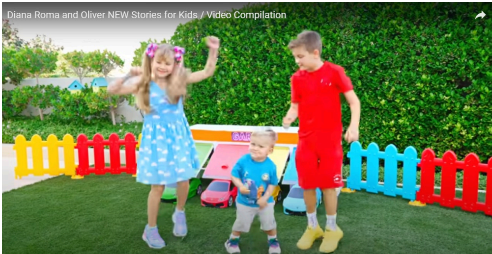
Figure 4 Scene Taken from Diana Roma Show (2023)

Level 1: Two children (boy and girl) playing with their younger brother. Celebrating something. The girl is seen wearing a sky blue printed sleeveless frock and has her hair tied up in two ponytails. She is stocky in form signifying her young age. She seems to be dancing as if celebrating some event. The second figure is of a toddler who is also wearing blue, and is wearing shorts and his physique is quite small compared to his siblings and he seems to be participating in dancing with his siblings. The third person is a young boy who is taller than the rest and is wearing red and he also seems to participating in the dance. The colorful clothes worn by all three children depict the playfulness and youngness of the content displayed and are apt to attract young audience.