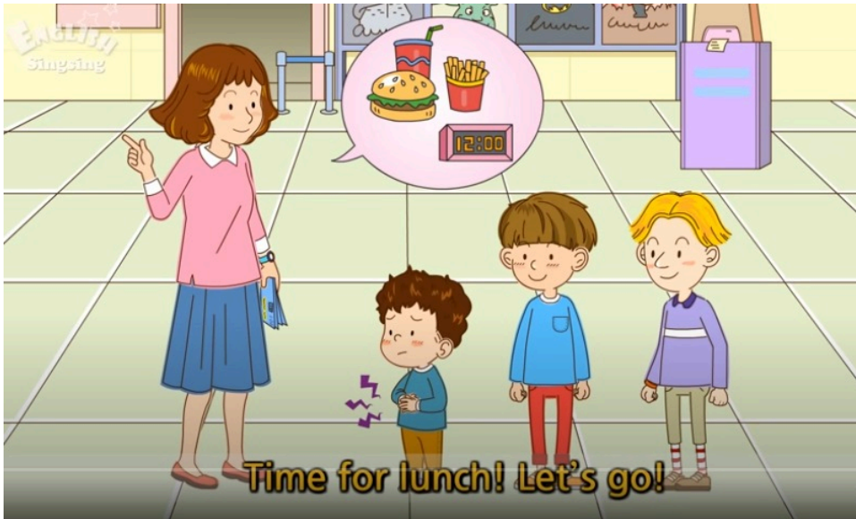
Figure 2 Scene Taken from English Singing, (2022)

Level 1: This picture is taken from an animated video. A mother standing with her three children. The younger one is feeling hungry and expressing his need to her. The children are in circular and short form and their physique is different than the adults. They are wearing colorful clothes which signifies their young age. The mother has an oval face shape and short hair which shows that she is practical, wearing a simple pink cardigan and a blue skirt to show her femininity, flat shoes that again shows her practicality as a mother. She is also wearing a watch and seems to be holding some tickets, which shows that they may have come to watch a movie. The youngest boy is shown holding his stomach which shows that he is hungry and the air cloud shows that the mother is pointing out that it's time for lunch.